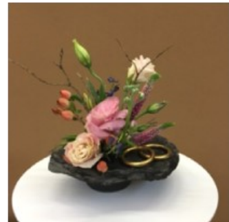
Class 5 “Wedding Bands” Ann Cooper