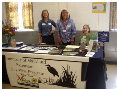
Members of Master Gardener Program