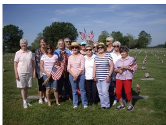
OGC members joined with other District I Club members to place flags on graves