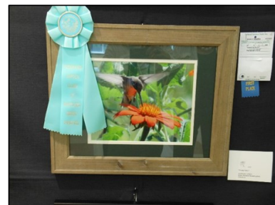
"Orange Ruby" Katy Green