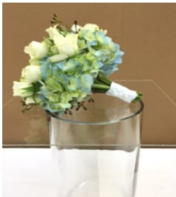
Class 4 “Flower Girl”