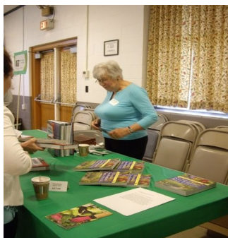
Speakers from Environmental Concern