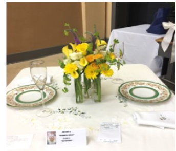
Class 3 “Reception” Trish Reynolds